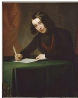
Charles Dickens (1842)