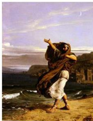
Demosthenes Practising Oratory (1870)